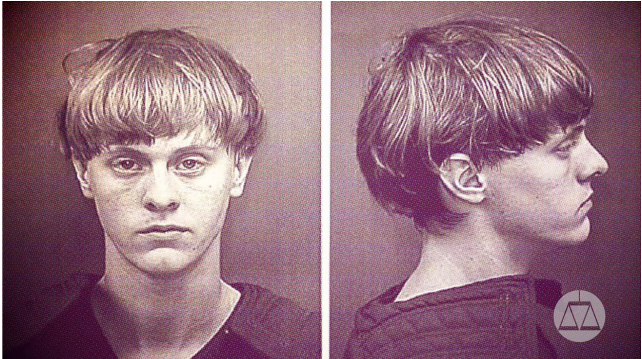
The Miseducation of Dylan Roof. SPLC. Accessed on 7.31.21 at https://www.splcenter.org/files/miseducation-dylann-roof