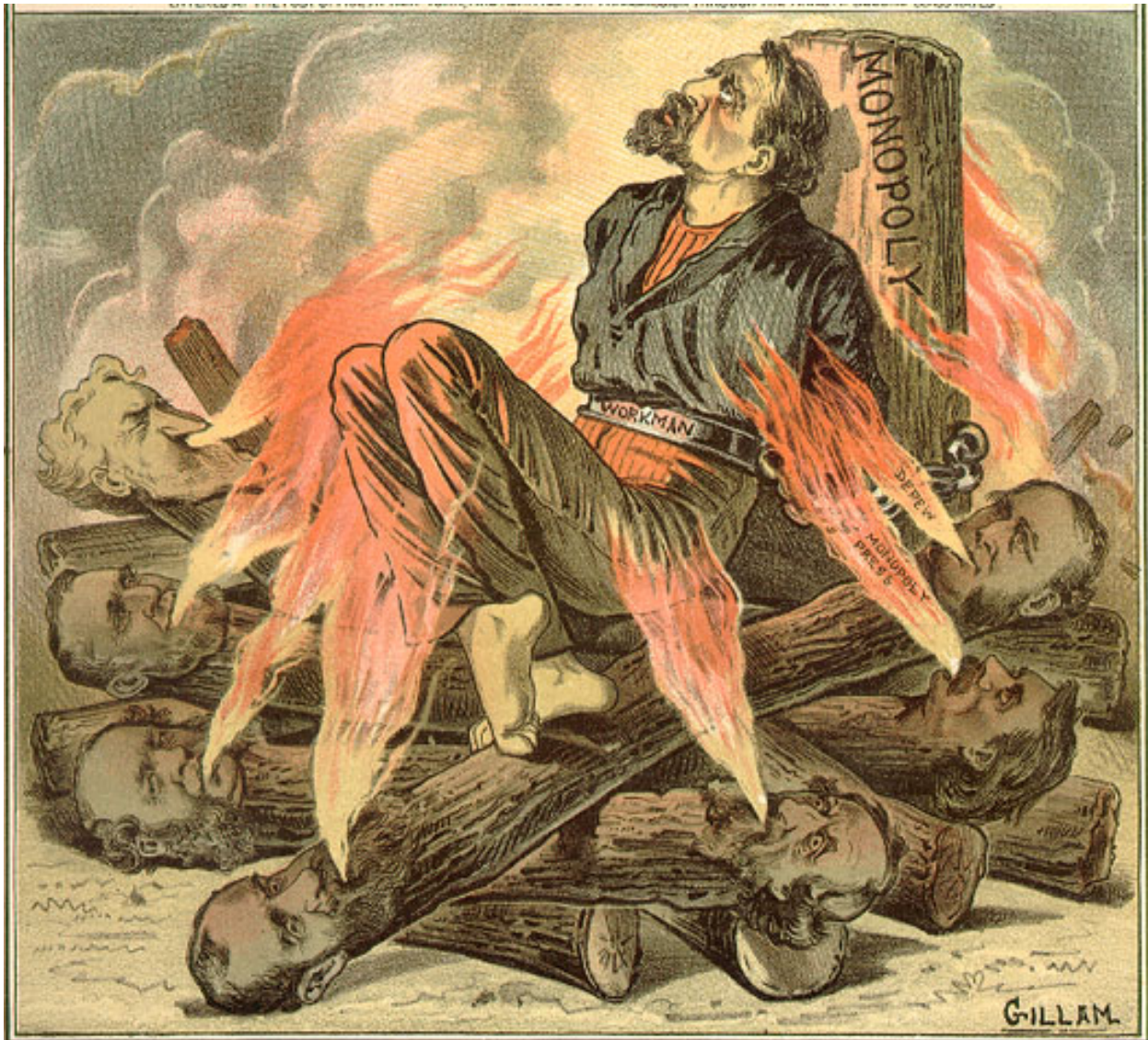
HOPELESSLY BOUND TO THE STAKE.

Accessed on 9.3.15 at www.loc.gov/pictures/item/2012645504/