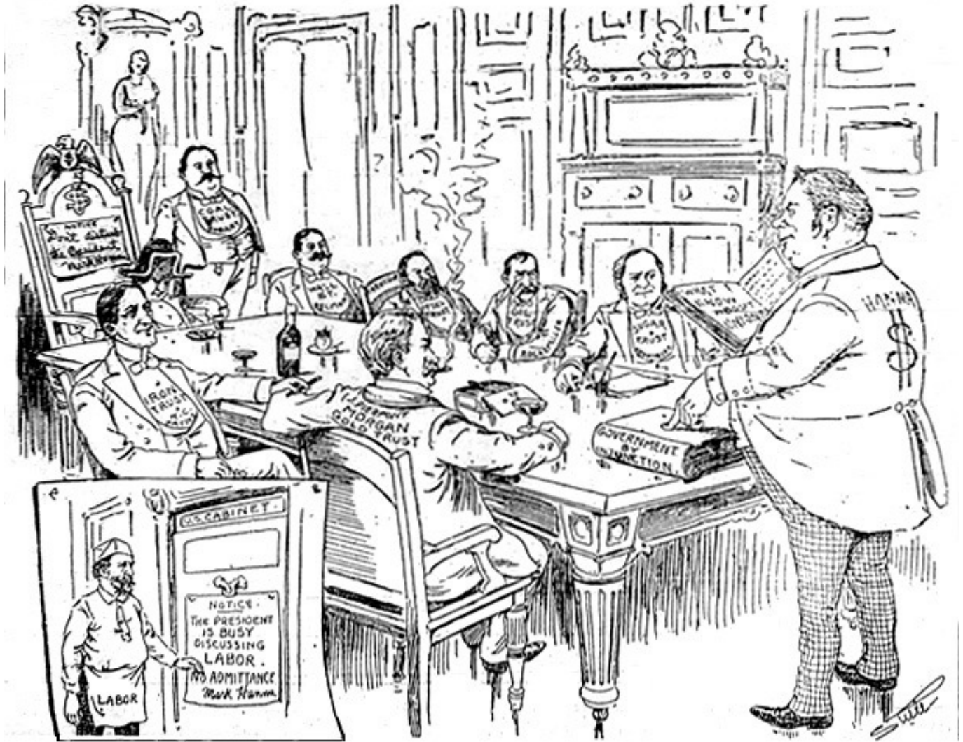
A Meeting of the Private Cabinet