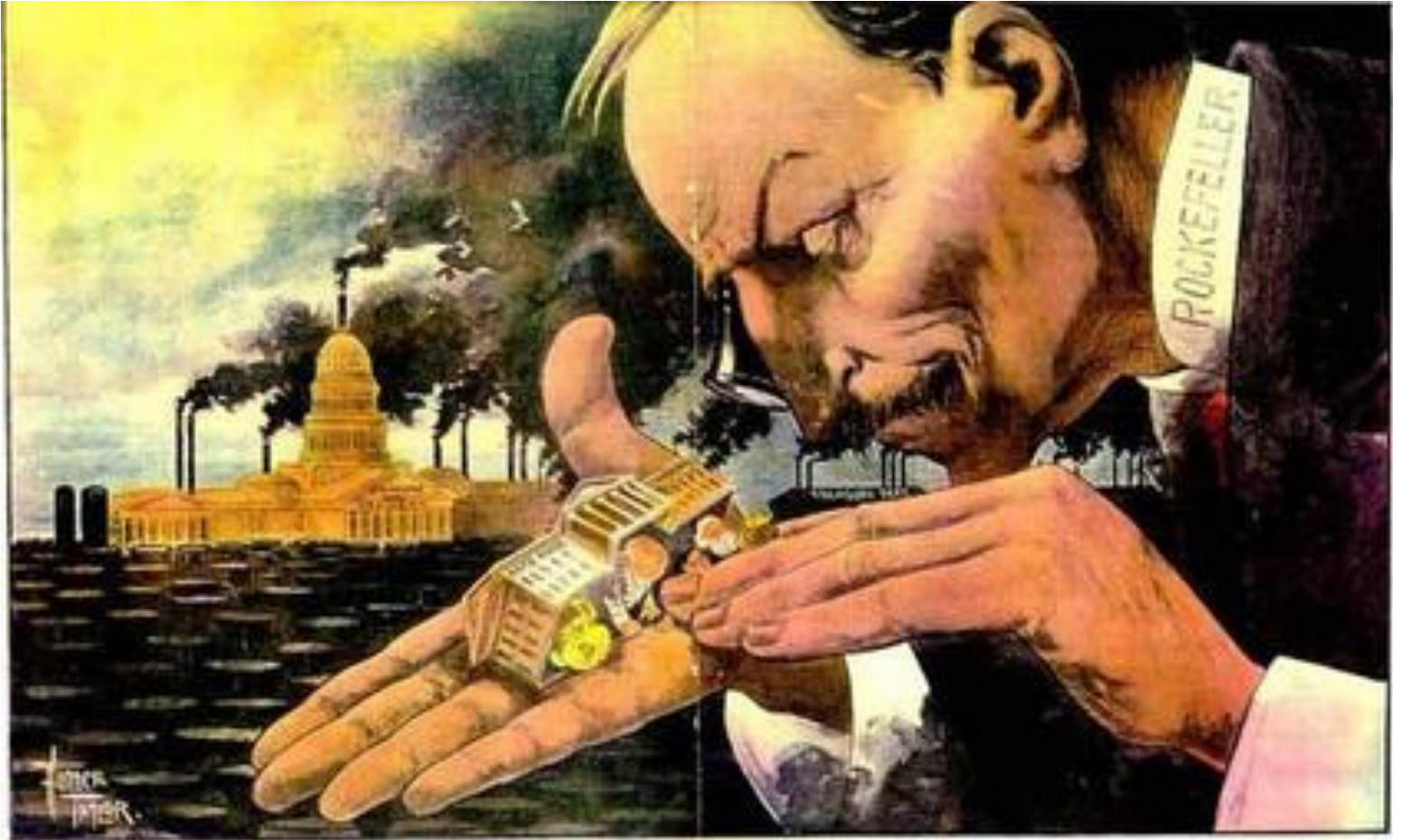
THE TRUST GIANTS POINT OF VIEW. "TRUST A FEW, LETTLE GOVERNMENT!"